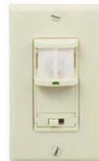
Passive Infrared Occupancy Sensor (replaces wall switch)