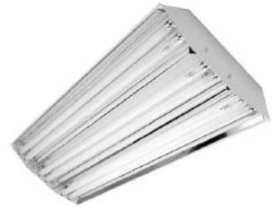
6-lamp Fluorescent High Bay Fixture