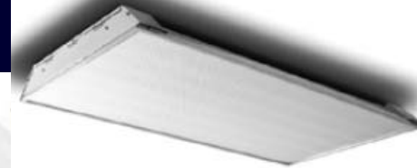
With Protective Polycarbonate Lens